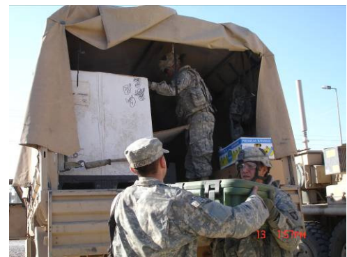
Distribution platoon Soldiers of the Delta Company 526 th Brigade Support Battalion, download rations from a truck at Joint Security Station Ghazaliya 3.