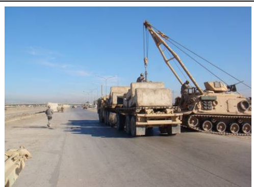
Soldiers of the Delta Company 526 th Brigade Support Battalion, download barriers in support of the Iraqi Army near Ghazaliya, Iraq.