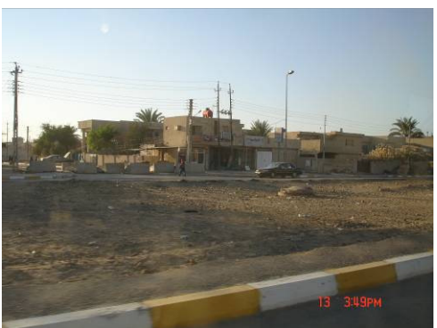
A store front along a route Delta Company 526 th Brigade Support Battalion Soldiers travel on a daily mission in the Ghazaliya District in Baghdad.