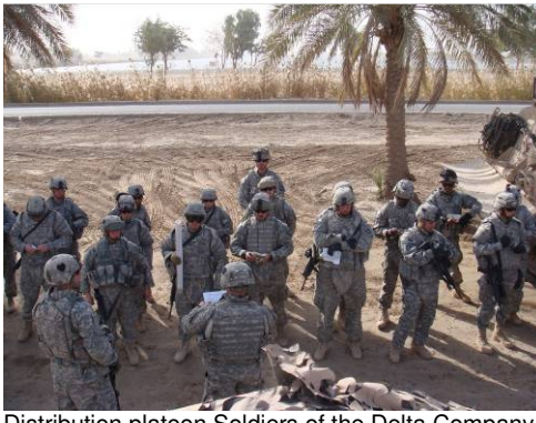
Distribution platoon Soldiers of the Delta Company 526 th Brigade Support Battalion, take notes during their convoy brief on Camp Liberty, Iraq.